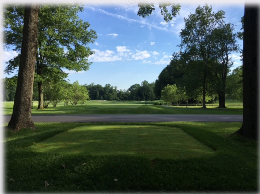
New Back Tee #5

If you would like to try it out, it will be open for use when you see some tee markers on it.