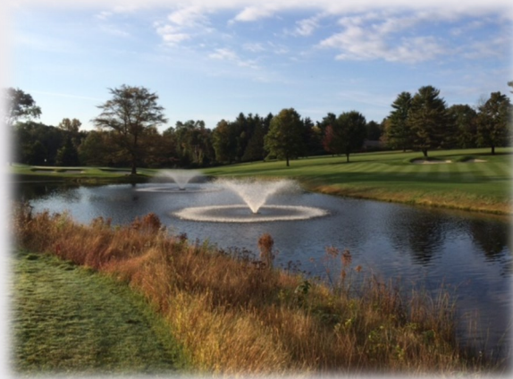
Golden Fescue in foreground

Establishing a stand of grass in that wooded area involves a number of steps for success. The first one is to kill all existing vegetation by spraying a non selective herbicide called Round -up. That product is translocated throughout the weeds, killing all plant parts including the roots, stems etc.