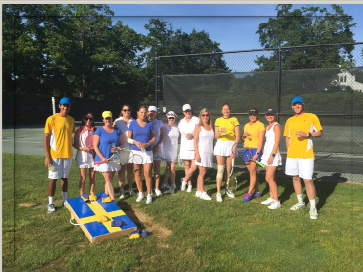
Swedish Midsummer Night Event