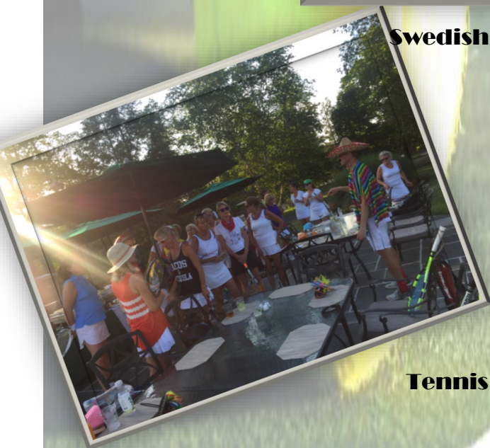
Tennis 105 "Mexican Night"