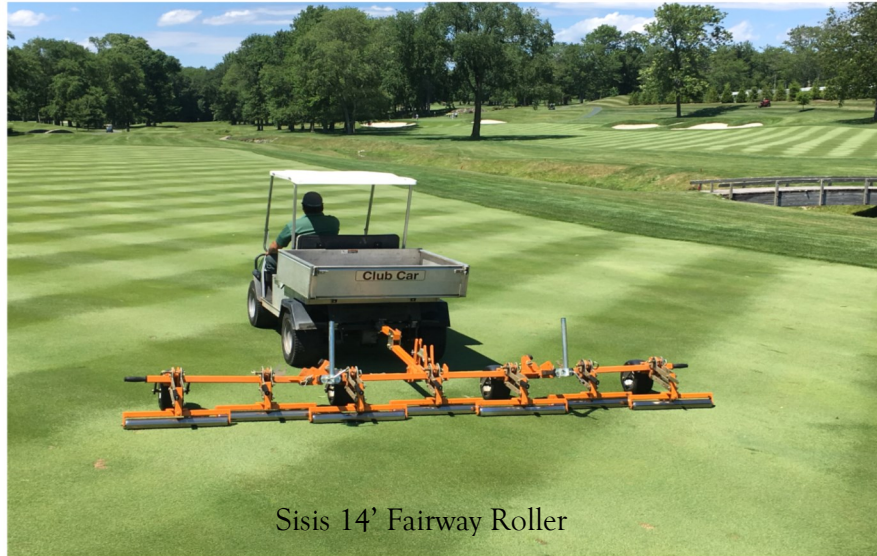
Sisis 14' Fairway Roller

Finally, we are very careful with our water management every day to only apply what's needed. We use weather data that gives us the Evapotranspiration Rate ( ET) each day, which is the amount of moisture transpired through leaf surfaces plus evaporation. A crop coefficient has been developed for turf, as well as all other crops, that indicates exactly how much irrigation water needs to be applied based on the ET rate. We actually use deficit irrigation on the fairways by only applying 66% of the total ET and then add water by hand to the localized spots that may need a little extra. Assuming the weather cooperates with normal to dry precipitation, we will do our best to give you the firm, dry fairway conditions that everyone enjoys.