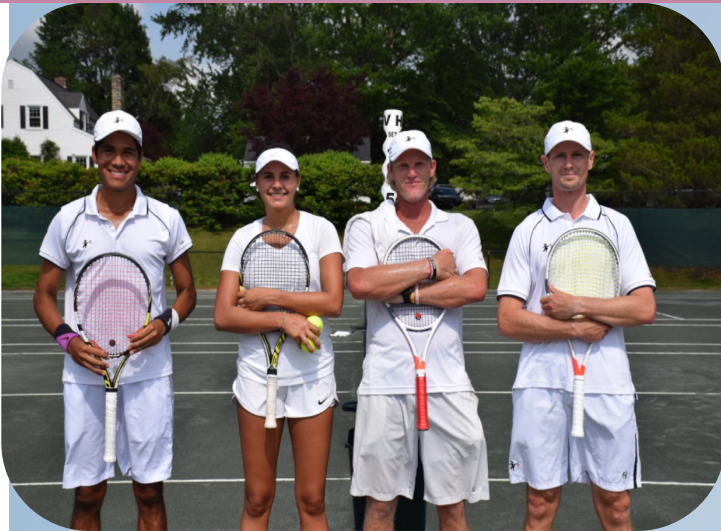
Tennis Exhibition Matches