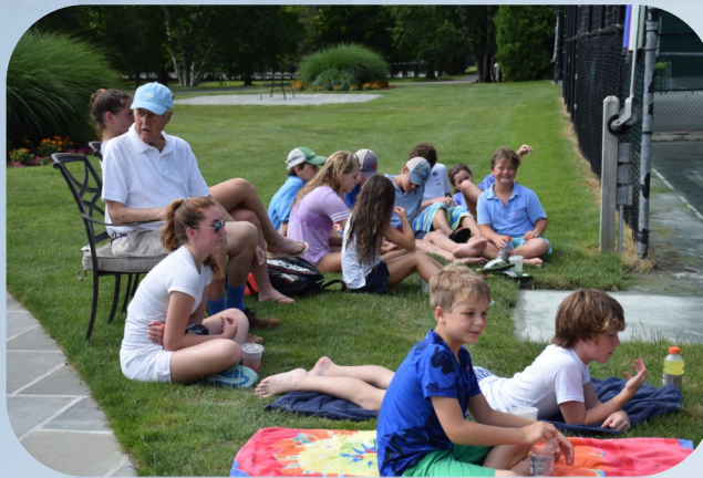
Tennis Exhibition Matches